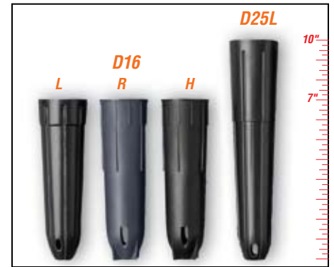
Light Weight (L) Recycled (R) Heavy Weight (H)

Please recycle. Light Weight = ♻️ Recycled = ♻️ Heavy Weight = ♻️