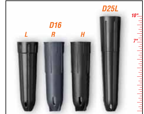
Light Weight (L) Recycled (R) Heavy Weight (H)

The Recycled D16 cells are manufactured of post industry, pre-consumer recycled polypropylene resin. Color may vary.