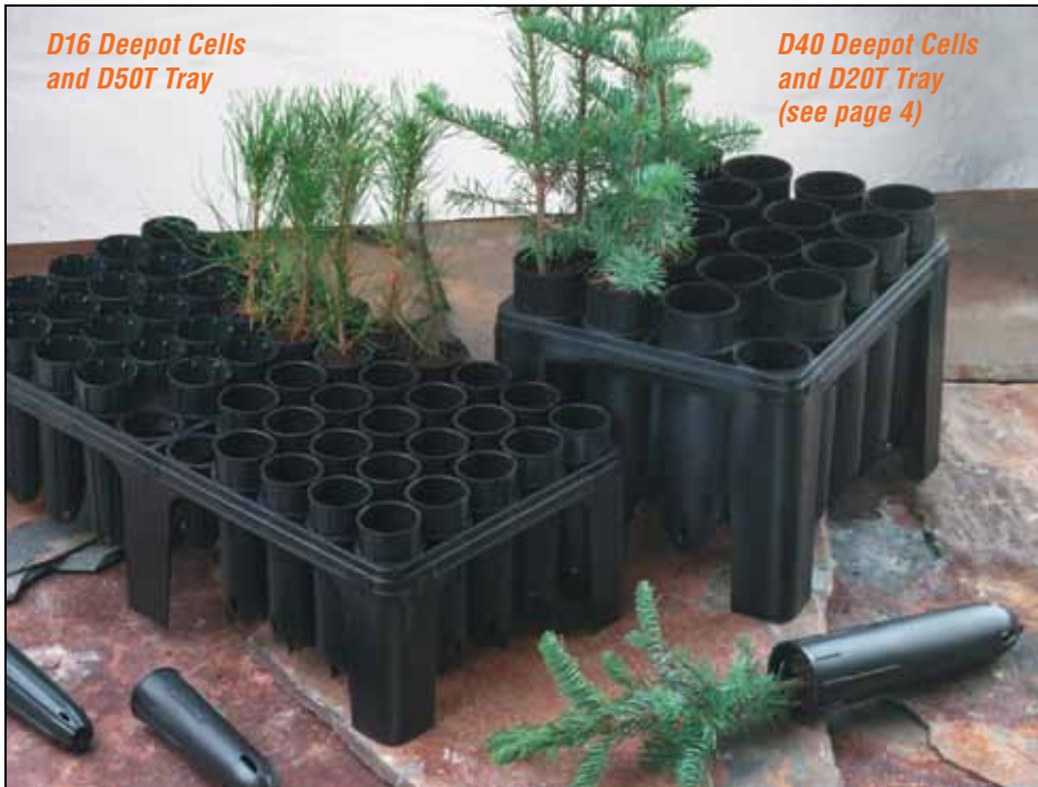
D16 Deepot Cells and D50T Tray