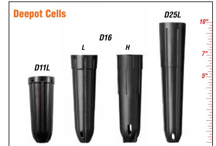
Light Weight (L) Heavy Weight (H)