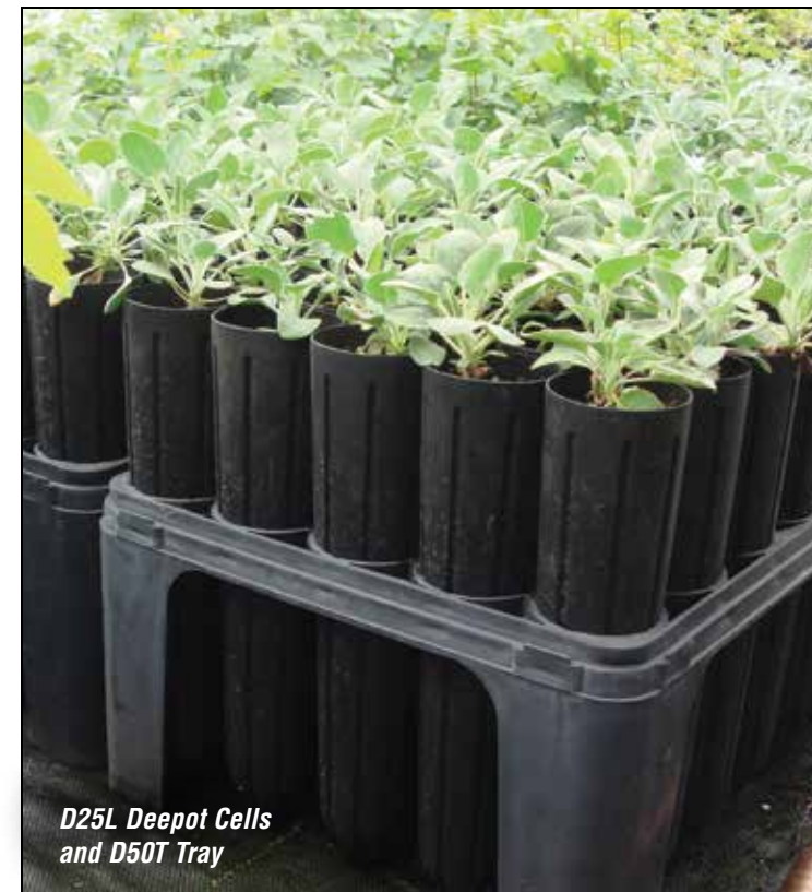
D25L Deepot Cells and D50T Tray

The Heavy D16 cells are manufactured of recycled polypropylene resin. Color may vary.